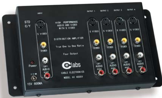
AV400SV Composite Video/Audio/S-Video Distribution Amplifier

High quality amplifier allows for multiple signal distribution equal to source signal output with no signal loss.